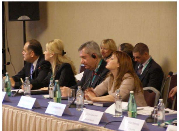
4 th Working Meeting of the Ministers of Agriculture from SEE