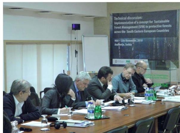
The technical discussion on Forestry