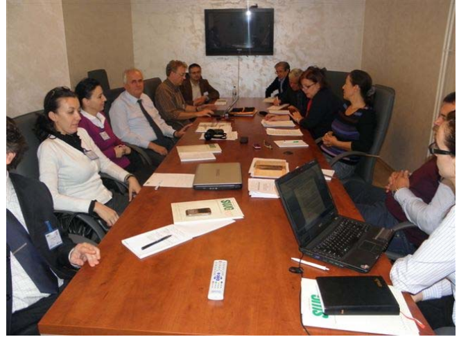
The technical discussion on Forestry