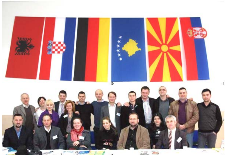
The young leaders conference