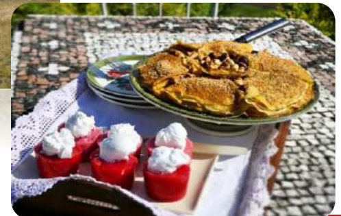
Drina-Sava Facebook page