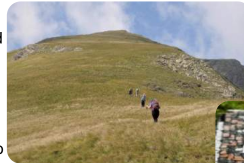
GIZ North Macedonia Facebook page