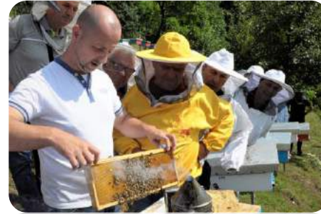
GIZ North Macedonia Facebook page