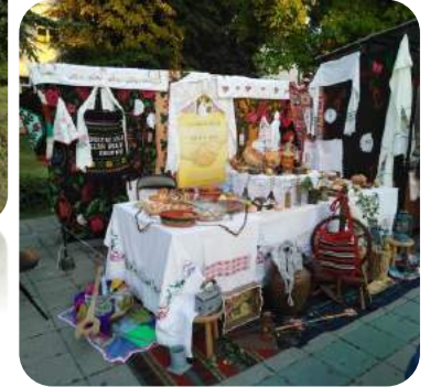
Drina-Sava Facebook page